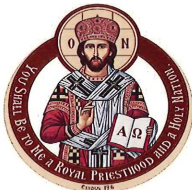
2025-26 Church School Theme