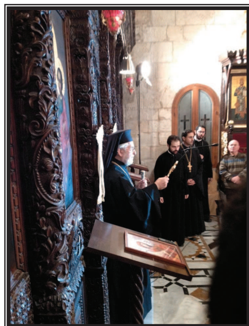
Patriarch Ignatius IV gives the final blessing at Divine Liturgy