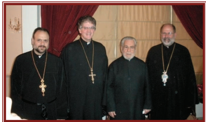
Patriarch Ignatius IV with the Bishops-elect from North America in his home at the Balamand