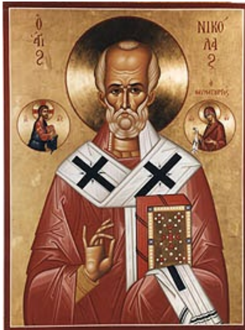
Feast Day of St. Nicholas the Wonder-worker and Archbishop of Myra in Lycia December 6 th

In the Moore poem, a modern family is invaded by a well-meaning old man who leaves gifts nobody seems to have asked for or even want. This is the first distortion of the real situation. May we all live our lives and lack nothing! Yet if we can penetrate the stories told of the actual fourth century bishop, under the layers of legend that cover St. Nicholas throughout the centuries, we find one feature common to each tale, no matter how distorted: Bishop Nicholas always aids those in dire need. Despite the myths surrounding the event, the extreme circumstances of those in the tales of St. Nicholas are much more like the life we know than the family in the Moore story.